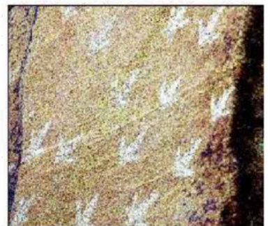
Burrup Peninsula rock art: A rich cultural vein but, some argue, a hindrance to industrial progress