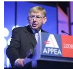
Martin Ferguson addressing APPEA 2008

"The first step of the exploration cycle is the Australian Government's Offshore Petroleum Exploration Acreage Release program, forming a key part of the Government's strategy to encourage investment in petroleum exploration."