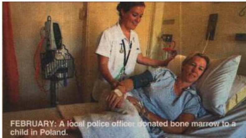
FEBRUARY: A local police officer donated bone marrow to a child in Poland.