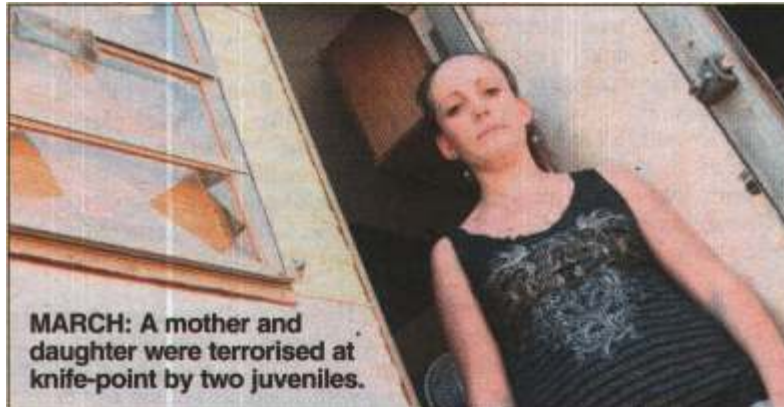
MARCH: A mother and daughter were terrorised at knife-point by two juveniles.